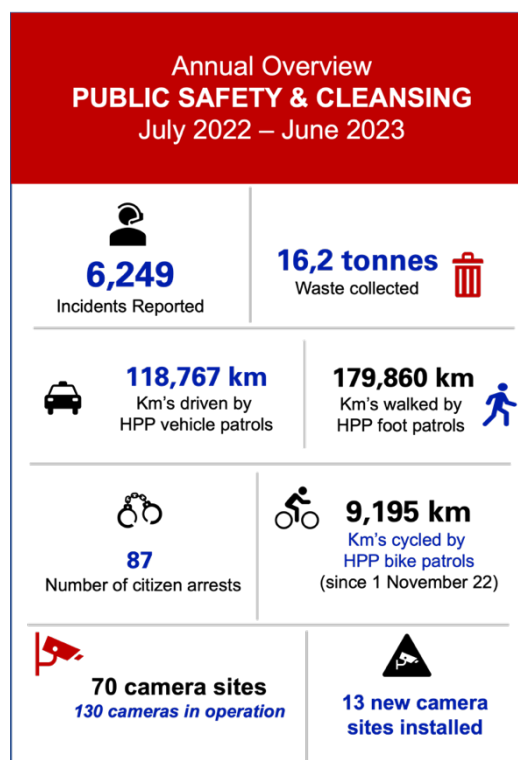
2: Annual Overview - 2022 - 2023